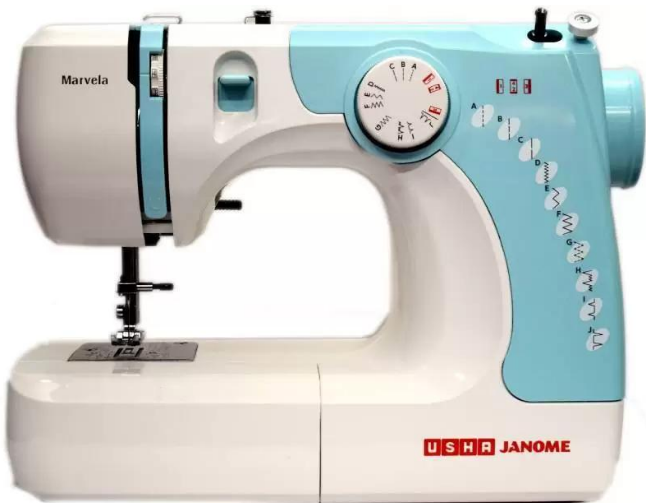
Usha Marvela Blue Janome Sewing Machine