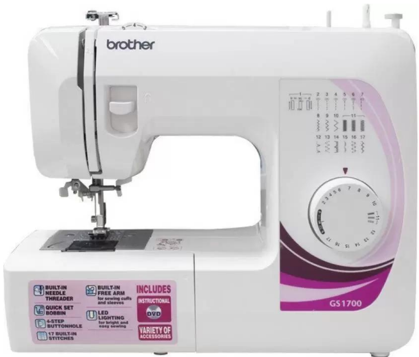
Brother GS 1700