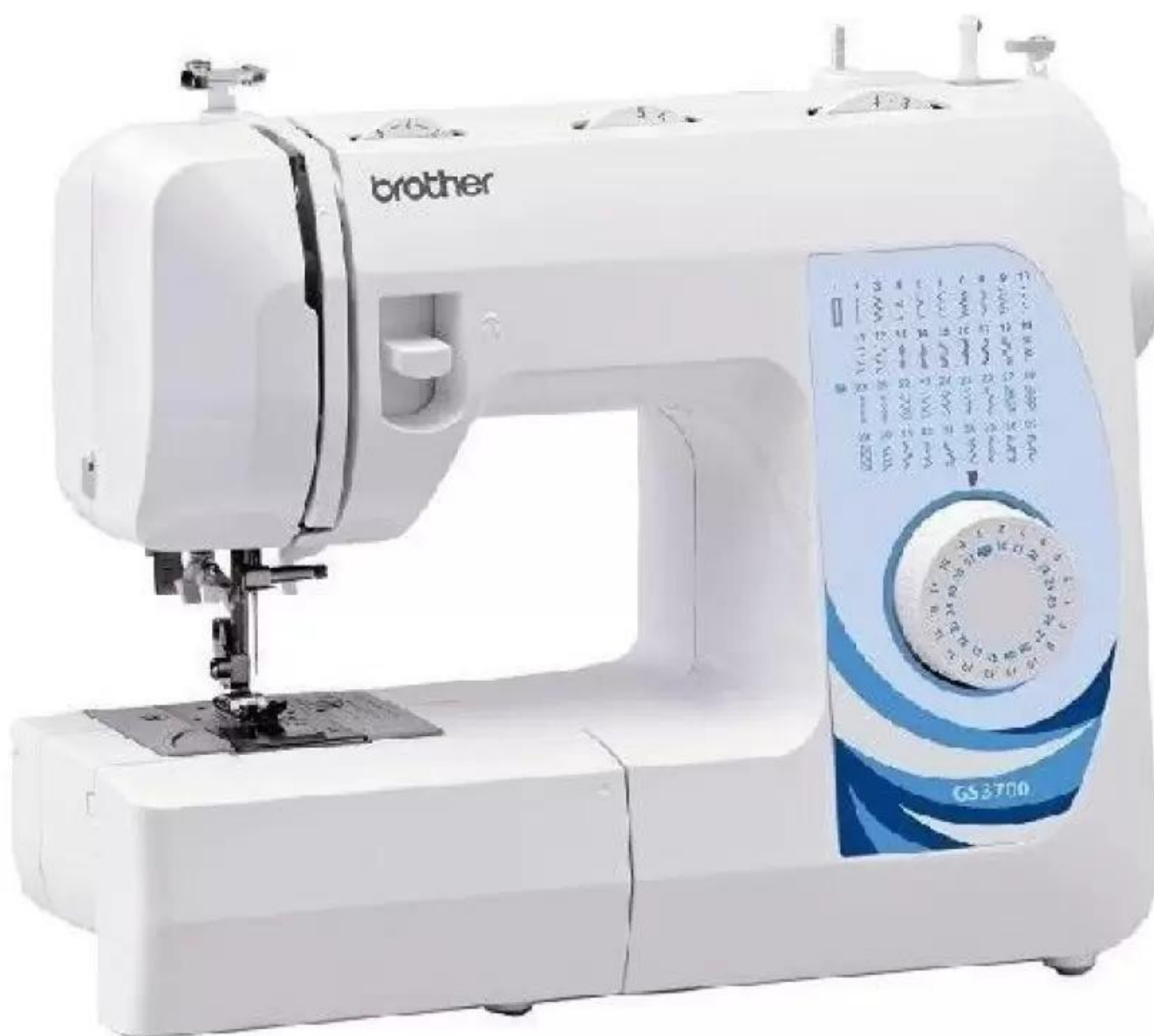
brother GS 3700

The Brother GS-3700 traditional sewing machine is a versatile and user-friendly device designed to cater to various sewing needs, from repairs to dressmaking and home furnishing projects. Let's delve into its features and specifications to understand how it can enhance your sewing experience.