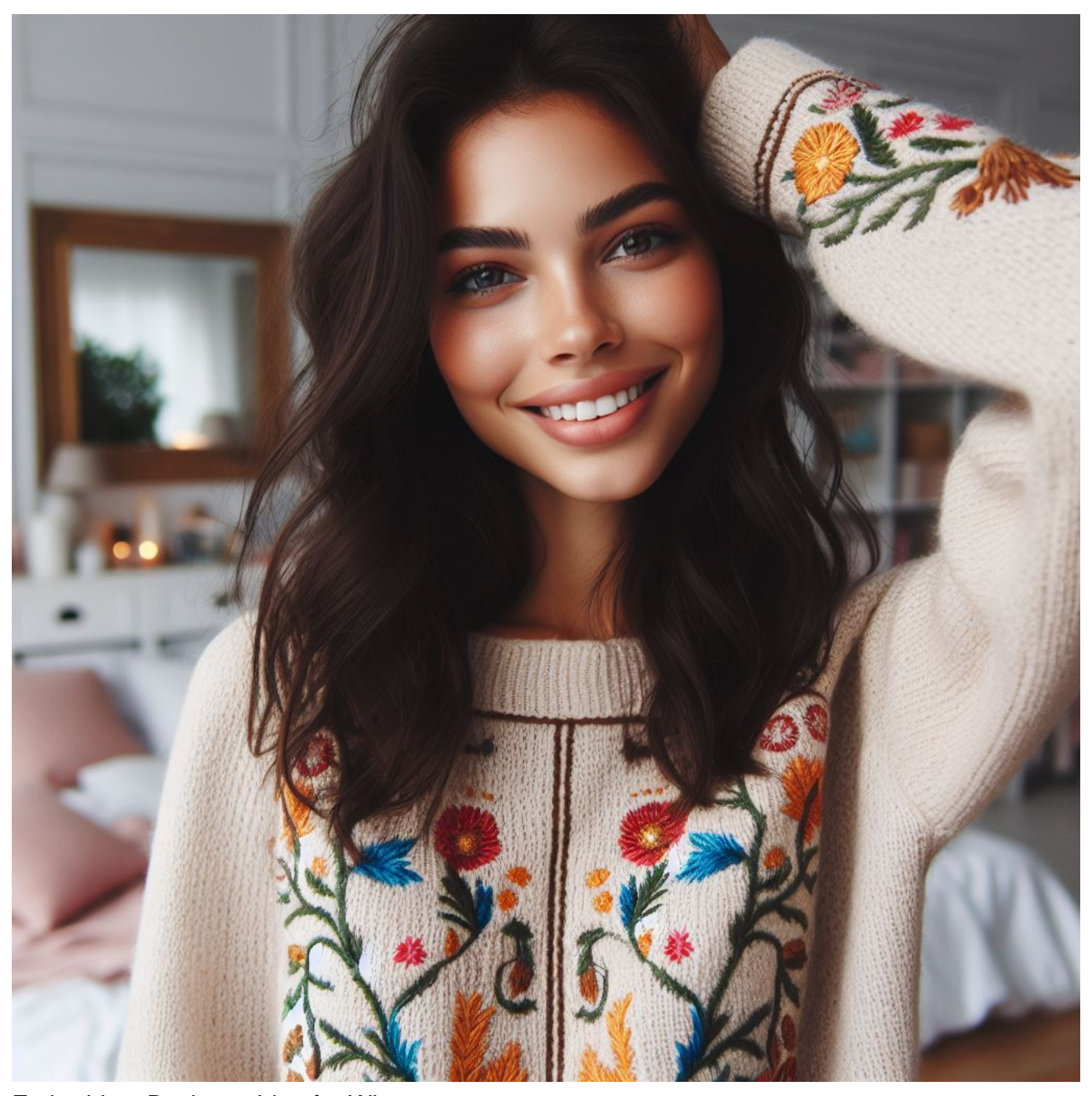
Embroidery Business Idea for Winterwear

Start a business that makes winter clothes extra special by adding custom embroidery. Imagine turning regular jackets, sweaters, and beanies into cosy and personalized pieces that stand out. Use warm and comfy fabrics to keep people snug during the winter. Offer cool embroidery designs like festive patterns or snowflakes, making winter clothes unique and perfect for the season. You can sell them as thoughtful gifts for the holidays or create sets for families. Make a simple website where people can easily choose designs and order online. Share your winterwear designs on social media to attract customers. This business idea is awesome because everyone needs warm clothes in winter, and you get to make them extra special and stylish.