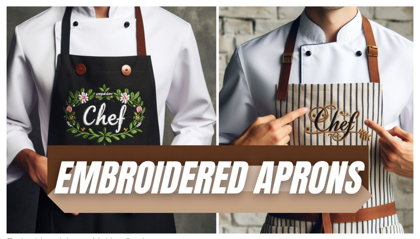
Embroidered Apron Making Business

Capitalize on the demand for personalized aprons for both food businesses and individual consumers, from barbecue to novelty designs. The business can offer custom embroidery services for aprons with unique designs and logos. This can be a great way to differentiate from other apron makers and attract customers who are looking for something unique.