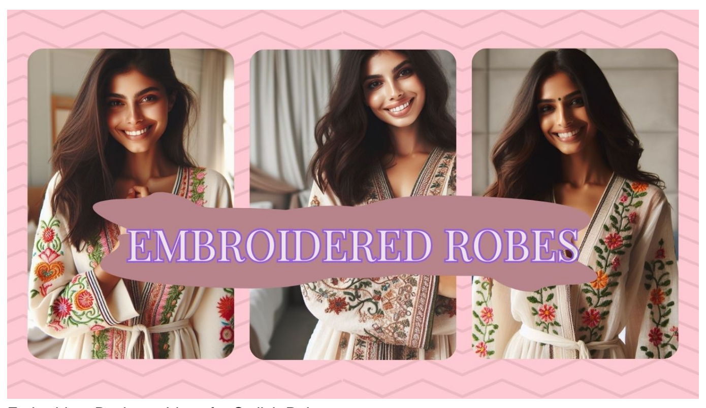
Embroidery Business Ideas for Stylish Robes

Start a business that makes comfy robes extra special by adding cool embroidery. Picture turning plain robes into stylish and personalized pieces that people love to wear. Use soft and fancy fabrics to make the robes feel luxurious. Offer trendy embroidery designs like initials, cool patterns, or even personal messages to make each robe unique. You can sell them individually or as thoughtful gifts for birthdays or weddings. Make a simple website where people can easily pick designs and place orders. Share your stylish robe designs on social media to attract customers. This business idea is great because everyone loves a comfy robe, and you get to make them extra stylish and personal.