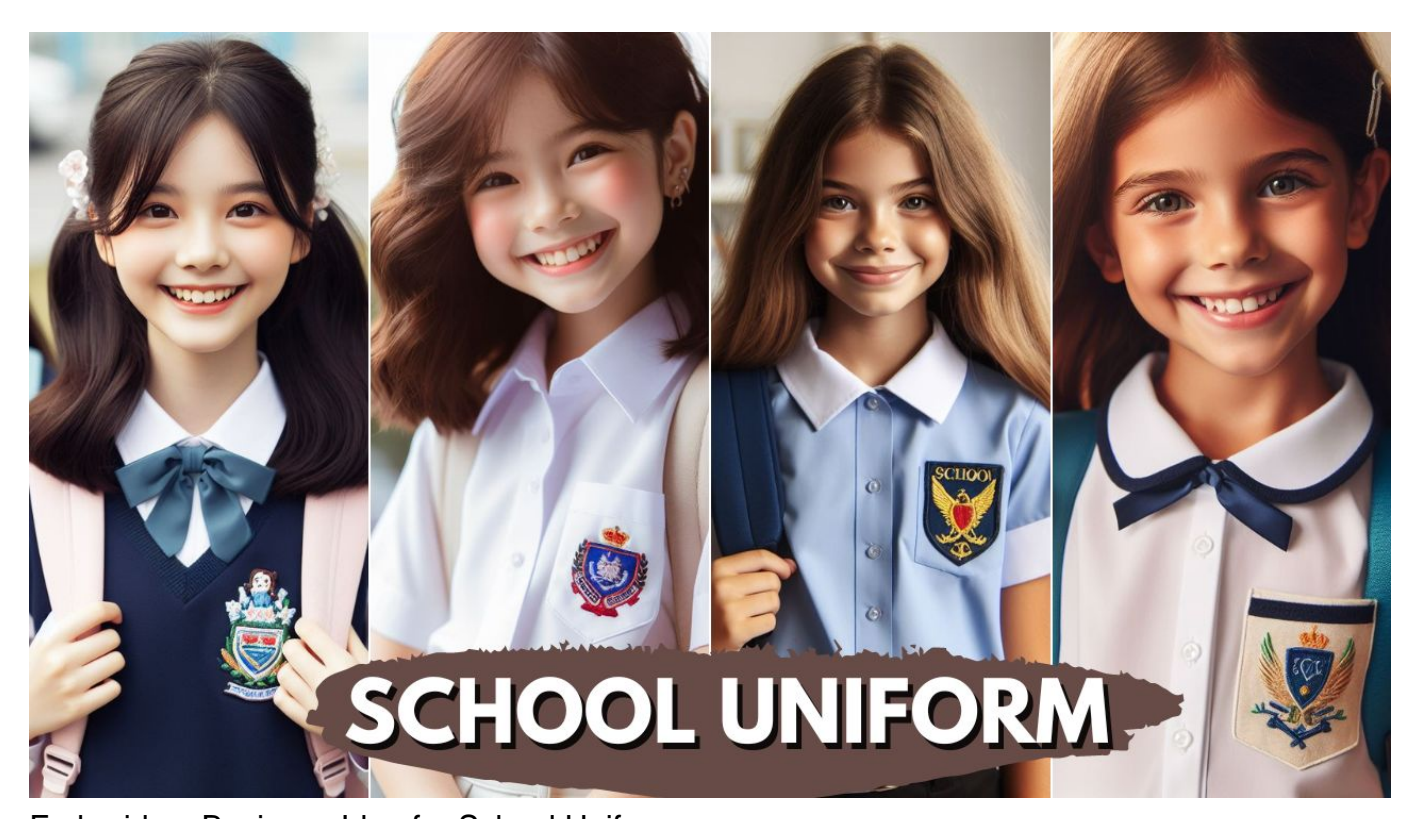
Embroidery Business Idea for School Uniform

School apparel embroidery is another cool embroidery business idea. Imagine providing embroidery services for school uniforms, spirit wear, and sports gear, enhancing school pride and unity. Partnering with local schools can be a crucial strategy, especially by embroidering the school badge or emblem on uniforms and promoting the school logo formally and effectively.