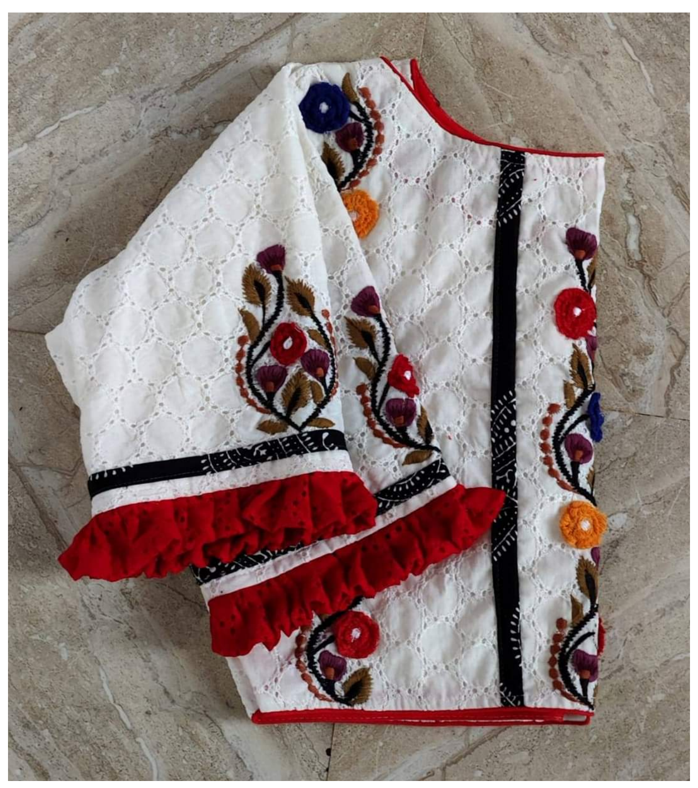
Embroidered Saree Blouse

you want quickly. You need a creative mind, nothing else.