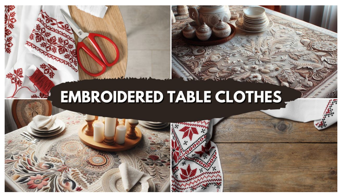
Embroidered Table Clothes

Make sure to use good-quality fabrics that look great and last. Set up a simple website where people can easily pick designs and place orders. Collaborate with event planners and caterers to expand your reach. This business idea is unique, with less competition, and allows you to showcase your creativity while meeting the year-round demand for elegant tablecloths.