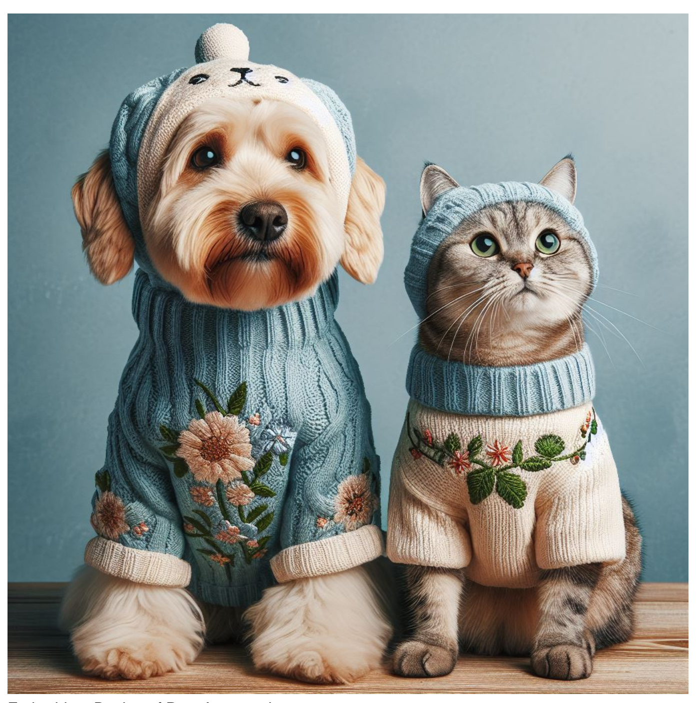
Embroidery Design of Pets Accessories

The pet wear industry has seen significant growth, and our previous blog post on tailoring business ideas also highlights the increasing demand for fashionable pet clothing. We know that embroidered fabric catches the human eye more easily. So, the "Pampered Pets" will cater not only to a business niche but also to the emotional connection people have with their pets, turning each embroidered accessory into a symbol of love and care.