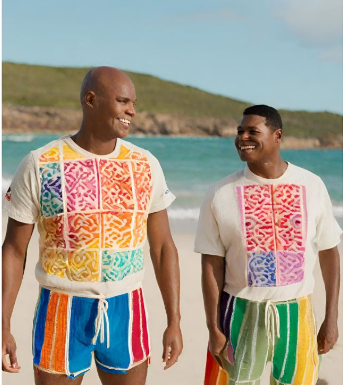
Embroidery Business Idea for Beach Wear

People try distinctive and funky accessories whenever they visit a coastal area for vacation. Be it a beachwear or a towel. As we all agree, embroidered fabric becomes more attractive or eyecatching than non-embroidered fabric. This is a unique embroidery business idea and an untapped business opportunity. You can use this opportunity to create a venture focusing on custom embroidery for beachwear essentials. The business taps into the vacation spirit by making personalised beach towels, wraps, and umbrellas, allowing individuals to make a stylish statement by the shore.