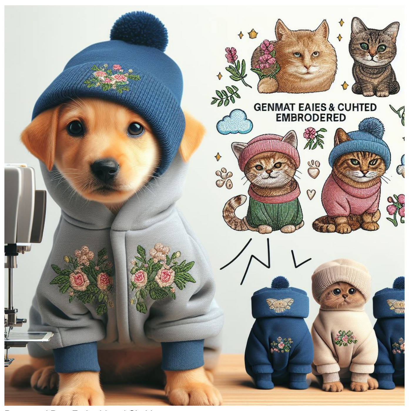
Pampered Pets Embroidered Clothing

Start a business called "Pampered Pets", where you make special designs on pet stuff like blankets, beds, and clothes. Imagine dogs and cats looking extra cute with custom embroidery! People love their pets like family and want to dress them up in cool clothes. If you can put unique embroidered designs on pet clothing, that's a new and cool business idea. It's like giving pets their unique style. This idea makes pet accessories stand out and is perfect for owners who treat their pets like family.