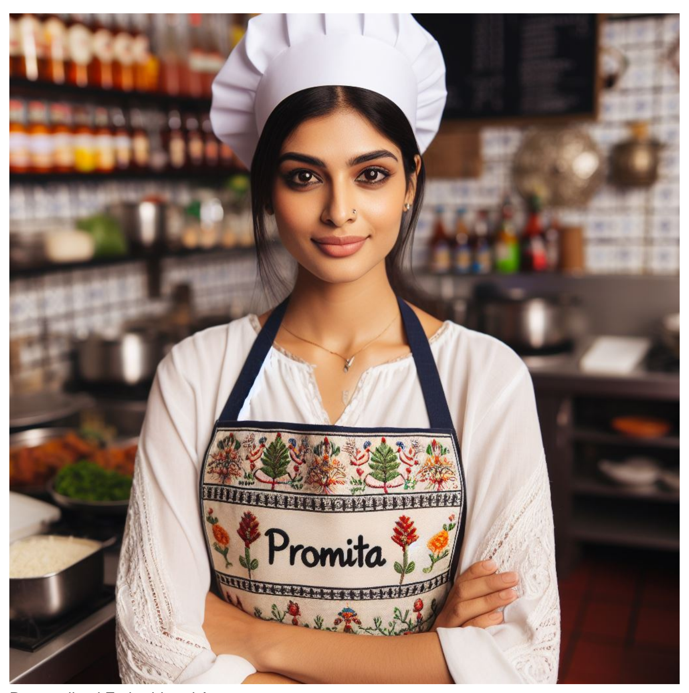
Personalized Embroidered Aprons

Moreover, the business can establish a strong competitive edge by not only catering to individual consumers but also by targeting food businesses looking to enhance their brand presence. Offering custom logo embroidery on aprons for restaurants, cafes, and catering services becomes a valuable service, creating a professional and cohesive look for staff uniforms. In a world where branding is crucial, personalized aprons become a powerful tool for businesses to make a lasting impression on their customers. Thus, the "Embroidered Apron Making" business not only addresses the rising demand for personalized culinary wear but also strategically positions itself to attract a broad customer base, from passionate home cooks to discerning food industry professionals.