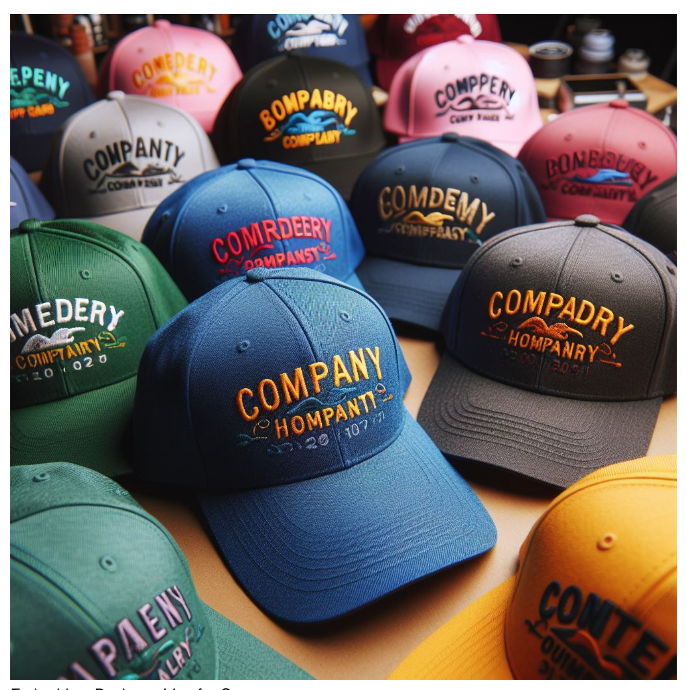
Embroidery Business Idea for Caps