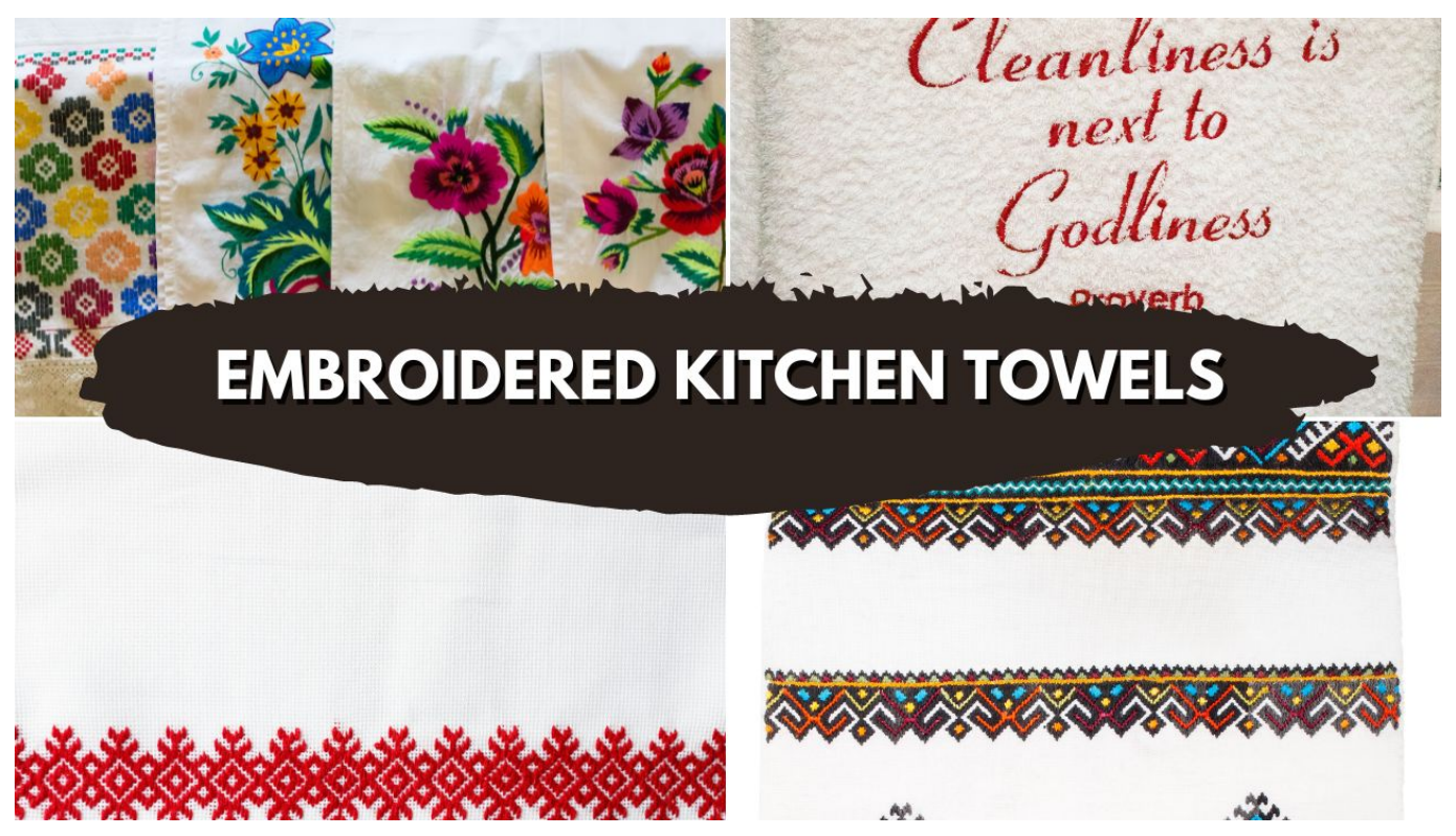
Embroidered Kitchen Towels

Start a business that makes special kitchen towels by adding custom embroidery. Ordinary kitchen towels look cute and unique with personalized designs. Use good-quality towels that soak up water well, making them not just pretty but also practical for everyday use. Offer different designs, like fun kitchen themes or even names, for a personal touch. You can sell these towels individually or create sets for gifts, making them thoughtful and affordable presents. Make a simple website for people to pick designs, place orders, and share your work on social media to attract customers. This business idea is great because everyone needs kitchen towels, and you get to be creative and make them extra special.