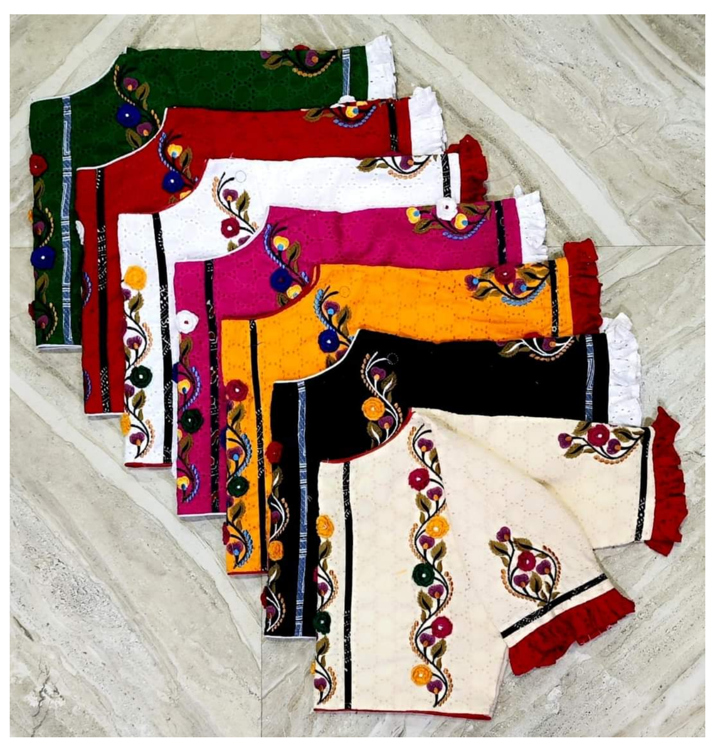
Embroidered Saree Blouse

Buy plain blouses from the market at wholesale rate. Make embroidery designs on them. Sale them at a higher price.