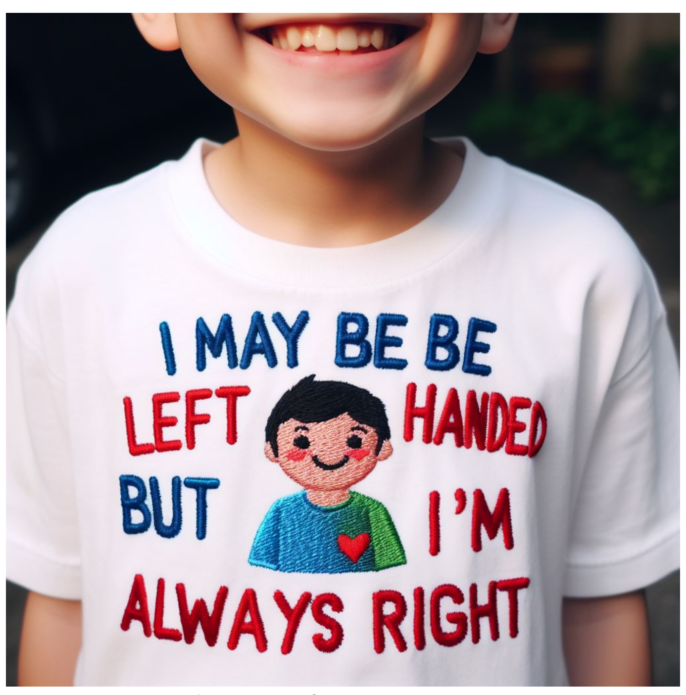
Embroidery Business Idea for Inspirational Quotes

For your e-commerce platform, consider incorporating a feature allowing customers to input their favourite quotes for customization on selected items such as T-shirts, hats, or caps. Implementing these personalized quotes onto the chosen apparel becomes straightforward and seamless if you have a computerised embroidery machine. If you have a physical shop or social media is your selling platform, then you can collect the favourite quotes of your customers manually.