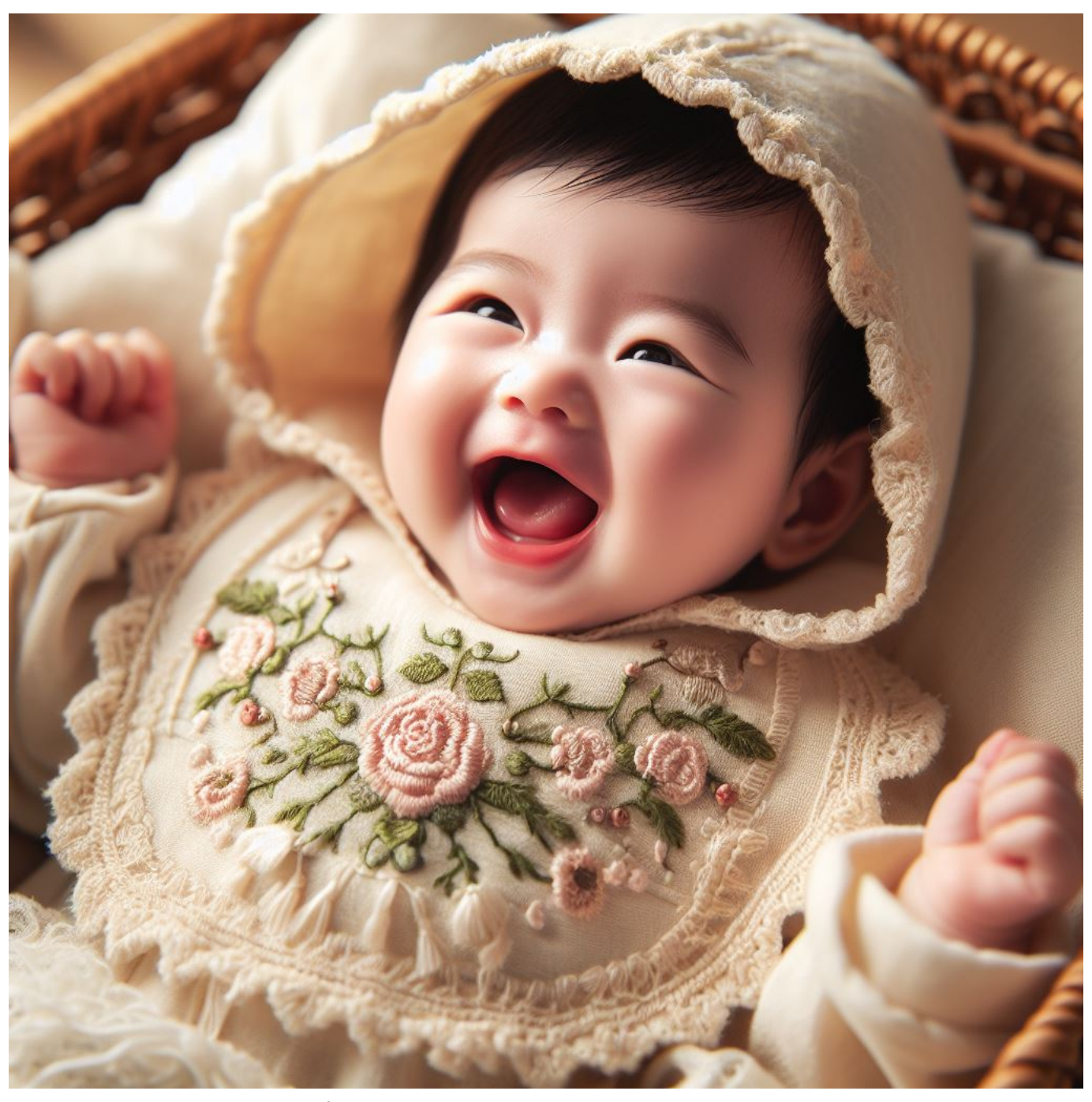
Embroidery Business Ideas for Baby Bibs

Imagine adding adorable and personalized embroidery to infant bibs and clothing, creating unique and cherished gifts for new parents. This niche allows you to corner the baby products market by offering a delightful touch to everyday essentials. Parents love to dress their little ones in cute and special outfits, and personalized embroidery takes it to the next level.