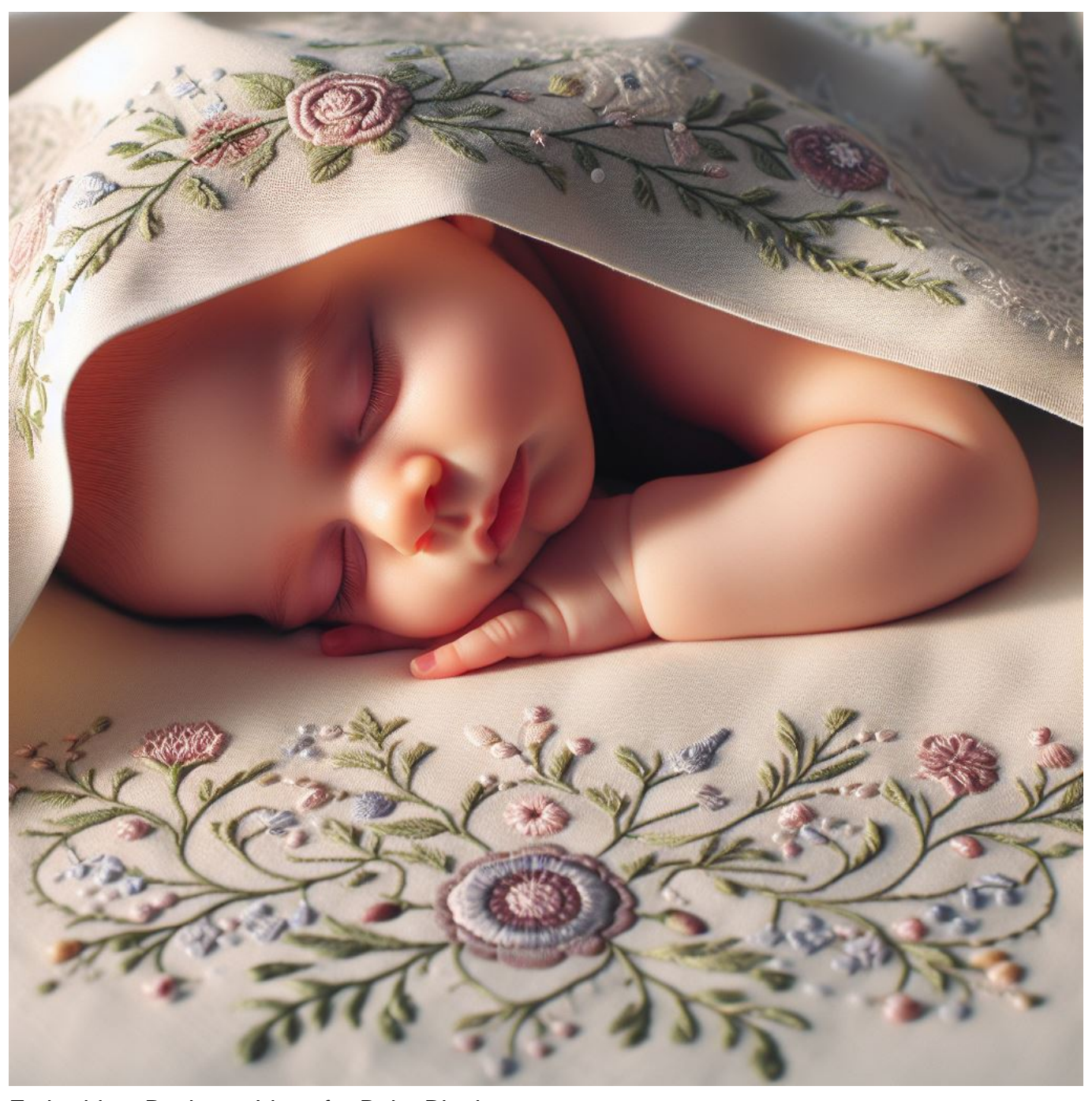
Embroidery Business Ideas for Baby Blankets

You can start an embroidered baby blankets business with a catchy name, "Blanket Blessings", which is a unique embroidery business idea focusing on custom baby blankets. Imagine creating adorable designs on cosy blankets, making each one a tiny work of art for newborns. This is an untapped business idea. Not many people have thought about this. Parents always seek special items for their little ones, and personalized baby blankets provide that unique touch. By offering a variety of designs and personalization options, you can stand out in the market. With the ease of online platforms, reach a broader audience and become a part of those precious family moments. It's not just selling blankets; it's about creating cherished memories for families.