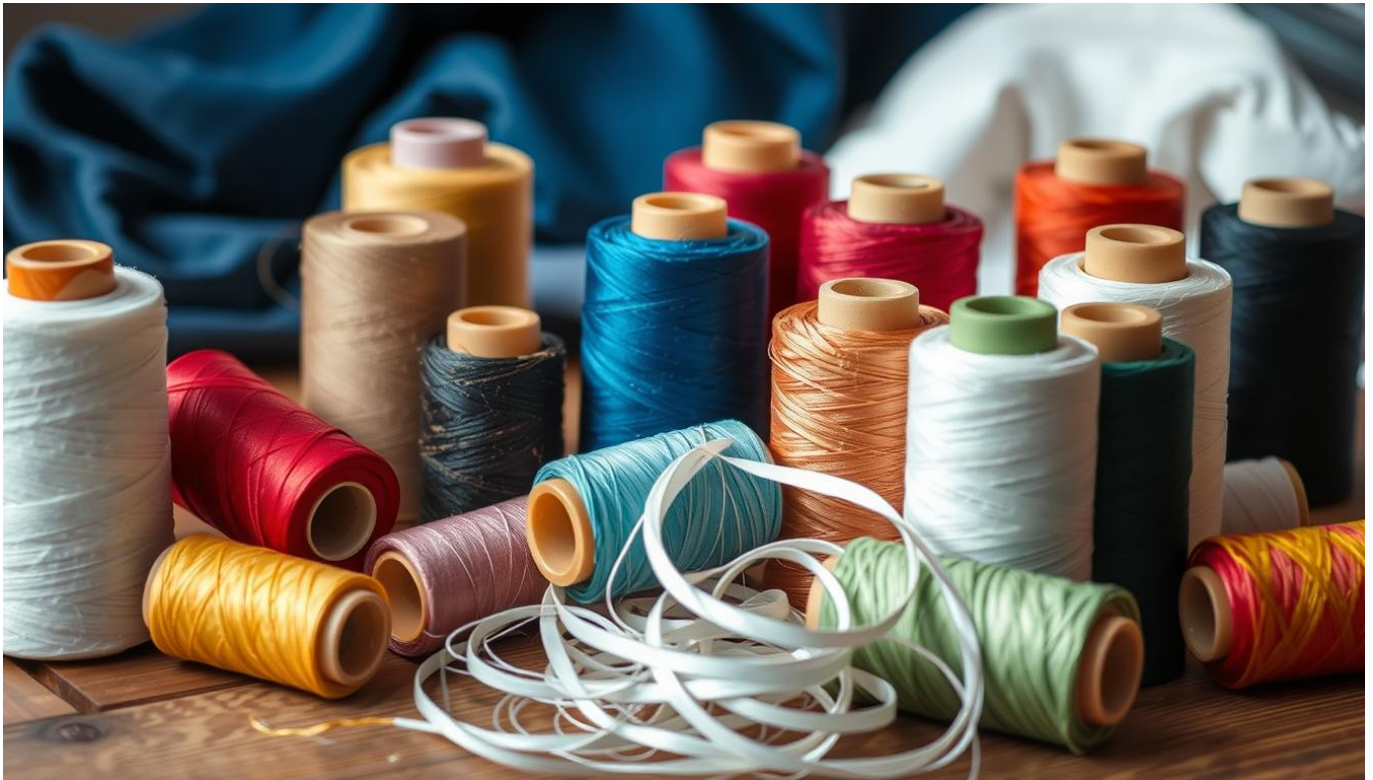
Sewing Thread Types

Whether you're new to sewing or a seasoned expert, understanding thread types is key to achieving perfect results. In this guide, we'll explore everything about threads, from their weight and construction to the variety of fibres available. With this knowledge, you'll be ready to choose the right thread for any project—no matter your skill level!