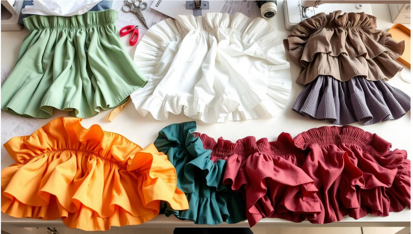
Types of Ruffles

Exploring sewing, you'll find the charm of ruffles. They've been in fashion for centuries, starting in the Renaissance. Ruffles can make your clothes look elegant and sophisticated. You can try different techniques to achieve various looks.