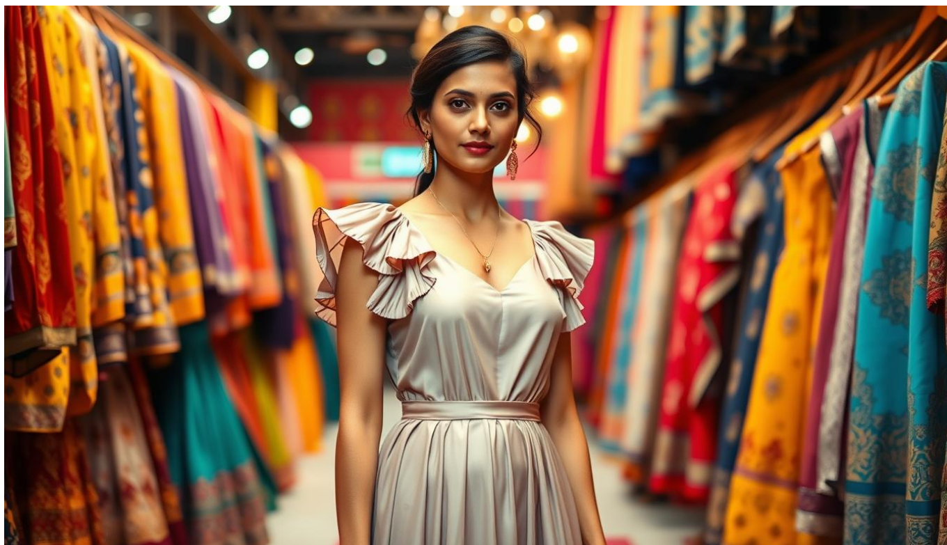
Flounce or Spiral Ruffled Dress

A circular or flounce ruffle is a type of ruffle that is cut from fabric in a circular or spiral shape, often resembling a doughnut or spiral curve. Unlike regular ruffles, typically made from rectangular fabric, flounce ruffles require more fabric to accommodate the full circle or curve. These ruffles naturally create frills due to the curved edges and can be attached directly to the garment without the need for gathering or pleating. However, to add extra fullness, the inner side of the circle can be gathered or pleated. Flounce ruffles tend to offer more fluidity and volume, creating a graceful, soft appearance compared to the more structured look of regular ruffles.